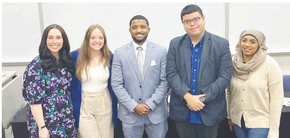
The 2023 panel for the 10th Annual Media Career Expo included past writers and editors for The Delphian .

Though students don't need to pre-register to attend, it is suggested that you email burby@adelphi.edu. Free pizza and soda will be served. 🍕