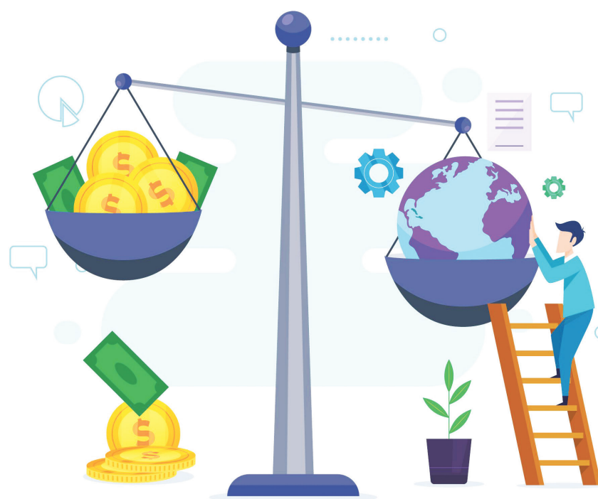
American capitalism is at a crossroads, striving to balance economic growth with social and environmental responsibilities.

Regardless, the status quo isn’t sustainable anymore, and the path the country chooses will have major implications not only for its future but for the global economy as well. 🌟