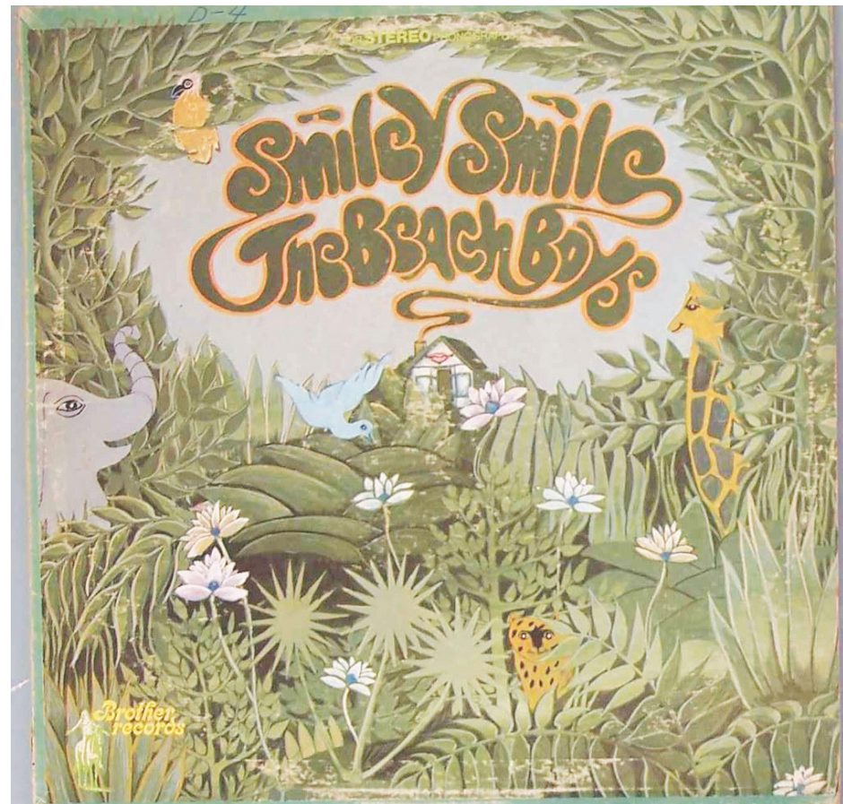
The Beach Boys’ “Good Vibrations,” which became their third US number one hit, landed on their 1967 album “Smiley Smile.”

YouTube video titled “Good Vibrations: The Beach Boys’ Pop Masterpiece,” both the song’s vocal and instrumental components cumulatively follow four beats per measure in an “ethereal descending chord progression.” The progression refers to the chorus following a chord pattern while remaining in the base chord E flat(b) Minor. This