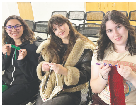
Students crochet and knit at a recent meeting.

Skins of brightly-colored yarn were spread out around the room. Hooks and needles clicked in the hands of crafters laughing together and sharing tips and encouragement. Some wore intricate handmade sweaters and accessories improved by years of practice, while others learned how to tie their very first slipknot. Arachne's Weavers' first official club meeting in October was a tapestry of community and creativity interwoven together.