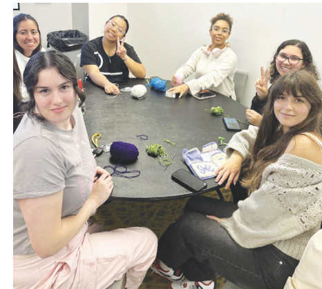
There's room to enjoy all styles of fabric art craftsmanship within the new club.

of beginner and intermediate tutorials. There are options for those who are left-handed as well as a place to