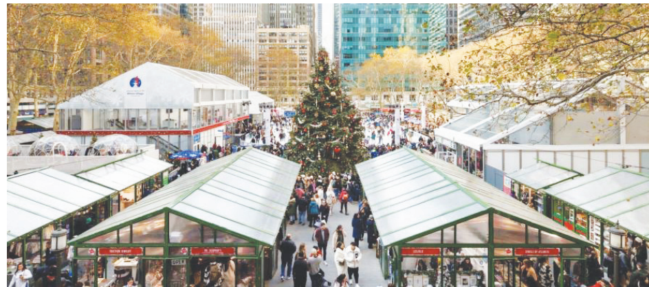
The festively decorated Bryant Park Winter Village in New York City is a great setting for Thanksgiving plans.

As always, there will be musical performances, this year from Idina Menzel and T-Pain, so be sure to bring your dancing shoes (or just buy a pair from Macys!). If you are an WNBA fan, members of the New York Liberty, along with their beloved mascot Ellie the Elephant, will also be marching as part of the parade. Let's go Liberty! Check out macys.com/parade for a sneak peek, the Parade Shop and more information.