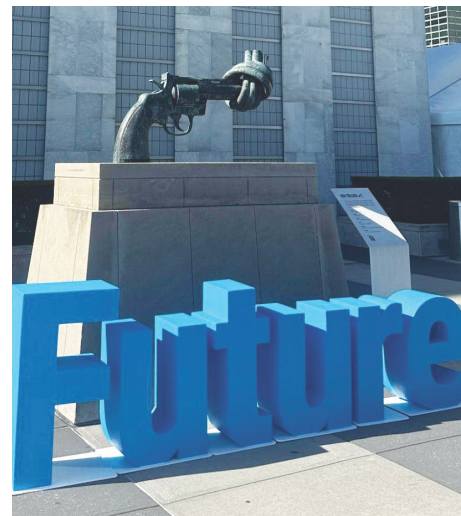
The sculpture called “Non-Violence,” a gift to the UN from Luxembourg

tension between smaller nations that are more vulnerable to climate change and larger, higher-polluting