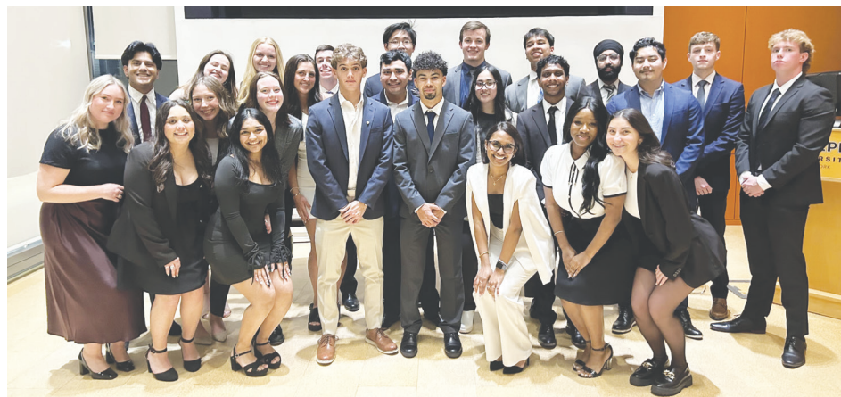
Delta Sigma Pi's spring 2024 initiation.

DSP participates in interfraternity council (IFC) recruitment periods