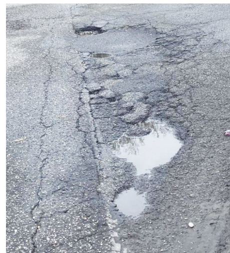
A series of reforming potholes on South Avenue entrance by the University Center.

went several inches deep. Pedestrians and cars were forced to maneuver around these obstacles for days and Public Safety marked them with orange safety cones. During the break, Facilities Management said they repaired more than 25 locations on the northern part of campus. Just two months later, one of the repairs caved in, resulting in yet another pothole