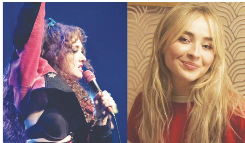
Pop sensations Chappell Roan (left) and Sabrina Carpenter (right) have risen to the top of the lists for many fans with their recent output.

vulnerability and edge, Roan’s music resonates with listeners looking for something raw and refreshing in a pop landscape often dominated by polished