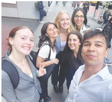
DSP toured "Hearts and Science," a marketing firm in Manhattan.

"Before joining Delta Sigma Pi, I had no professional experience, a fear of public speaking, and no idea that I had any ability to be a leader," she said. "The business fraternity allowed me to gain confidence in public speaking, interviewing, professionalism, leadership, communication and more."